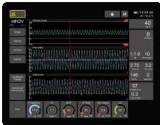
HFOV can be defined as the delivery of small tidal volumes at very high rates and is lung protective. The rates are typically between 10Hz and 15Hz.