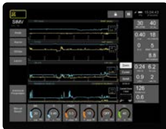
Trends Up to 14 days of trends are stored for all parameters. Zoom and scroll to find any parameter's values at a particular time.