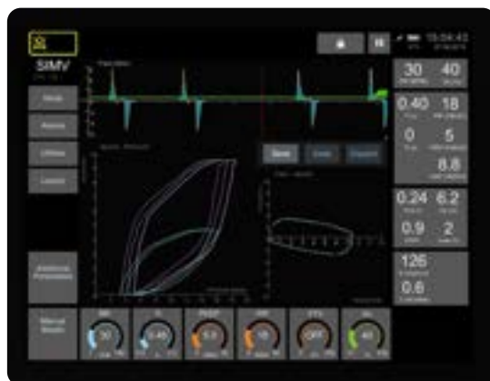
Loops A lung mechanics screen shows additional data - in this case two loops. A secondary column of data can be shown when required.