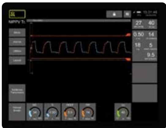
The SLE6000 can be used for non-invasive ventilation and High Flow Oxygen Therapy when these modules are installed on the ventilator.