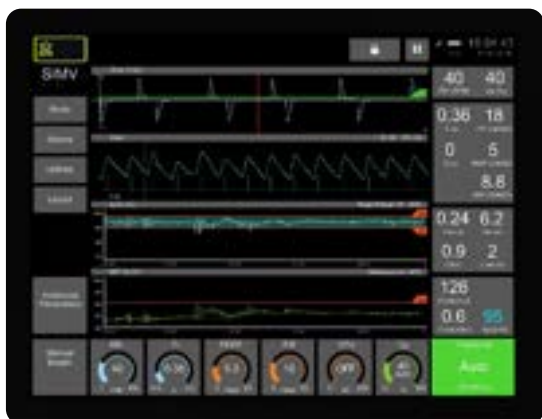
OxyGenie® An automatic O 2 control for the SLE6000 ventilator. The SLE6000 continuously adjusts the FiO 2 to maintain a stable SpO 2 [9] .