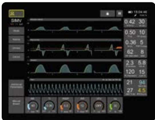
Synchronised Intermittent Mandatory Ventilation, or SIMV, is a patient interactive mode of ventilation. It can be used with PSV and/or VTV.

The SLE6000 sees the introduction of a Capacitive touch interface, which incorporates a low-glare screen (in keeping with the increased emphasis on developmental care) whilst setting a new benchmark in usability. Recent research in developmental care has shown that excessive light is involved in retinal damage, sleep pattern alterations, disturbance of circadian rhythms and poor growth [4] .